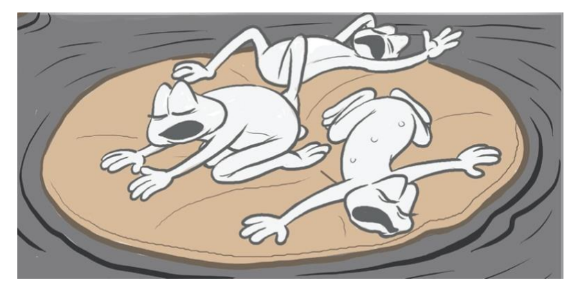
Figure 2: The pond was grey. The frogs had frozen like statues

The four winning stories are listed above and described in detail below.