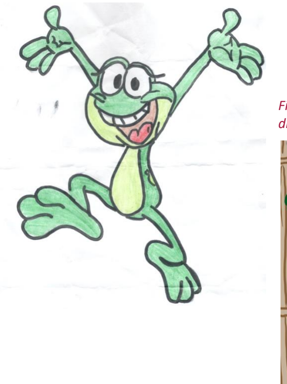
Figure 7: Marco Tibasima's illustration of Nakiete's drawing

Figure 6: Nakiete's drawing of the frog after she saves her community